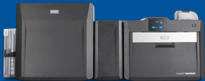
Dual-sided printer/encoder with optional lamination