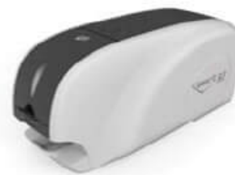
Rewritable ID CARD PRINTER smart-31 R