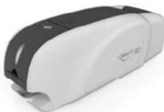
Dual sided ID CARD PRINTER smart-31 D