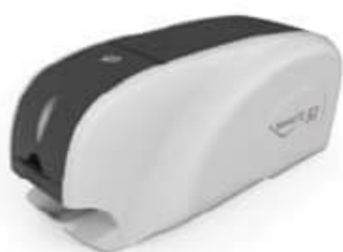
Single sided ID CARD PRINTER smart-31 S