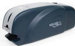
Dual sided ID CARD PRINTER SOLID-310D