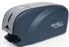
Single sided ID CARD PRINTER SOLID-310S