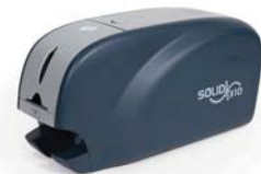
Rewritable ID CARD PRINTER SOLID-310R